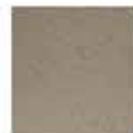
571S Puntan Gray