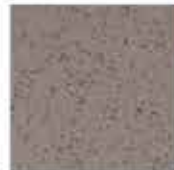
57XA Puntan Gray

A one-of-a-kind slip resisting tile with a Dynamic Coefficient of Friction of