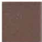
108 Chestnut Brown