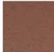
31XA Mayflower Red