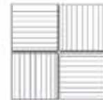
GRID PATTERN For use in multi-directional traffic, such as commercial kitchens.

V1 UNIFORM APPEARANCE \geq .60 SLIP COEFFICIENT D.C.O.F