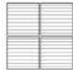
LINEAR PATTERN When traffic flows across the treads in a hallway or on a ramp