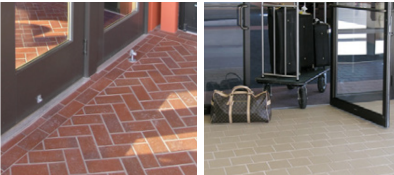
Photos above: Metropolitan Ceramics® Tile used indoors and out in heavy traffic areas. To the right: Down to Earth® installed at the Georgian Terrace Hotel- Atlanta.

And, with the addition of the Down to Earth® line of textures and classic size options, more high end looks are available. Consider Metropolitan when you need a product that will deliver years of worry free service.