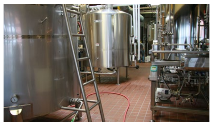
310 Mayflower red shown above and to right at Founders Brewery in Grand Rapids, Michigan

Craft brewers pride themselves on creating unique and outstanding beers that set the mark for flavor and character. And from holding tanks to filtration systems, craft brewers know the equipment they use has to be right. Not only are they most concerned about the quality of the product, but also the appearance of their brewery. That's why so many brewers choose Metropolitan Ceramics quarry tile for their flooring. They know kiln fired Metropolitan quarry tile will provide generations of quality, slip resisting, service. They also know the natural earth tone colors will fit right in with their brewery's design. Tastes may change with the season, but a Metropolitan Ceramics floor will stand the test of time.