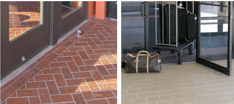
Photos above: Metropolitan Ceramics® Tile used indoors and out in heavy traffic areas. To the right: Down to Earth® installed at the Georgian Terrace Hotel- Atlanta.

And, with the addition of the Down to Earth® line of textures and classic size options, more high end looks are available. Consider Metropolitan when you need a product that will deliver years of worry free service.