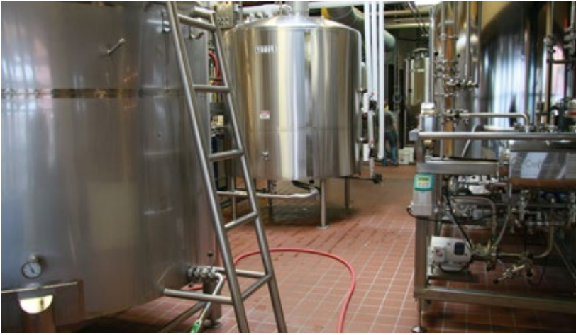
310 Mayflower red shown above and to right at Founders Brewery in Grand Rapids, Michigan

Craft brewers pride themselves on creating unique and outstanding beers that set the mark for flavor and character. And from holding tanks to filtration systems, craft brewers know the equipment they use has to be right. Not only are they most concerned about the quality of the product, but also the appearance of their brewery. That's why so many brewers choose Metropolitan Ceramics quarry tile for their flooring. They know kiln fired Metropolitan quarry tile will provide generations of quality, slip resisting, service. They also know the natural earth tone colors will fit right in with their brewery's design. Tastes may change with the season, but a Metropolitan Ceramics floor will stand the test of time.