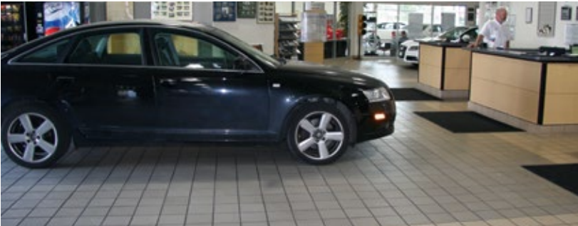
The photo above shows Metropolitan Ceramics tile used in a service entrance. The image to the right shows Metropolitan used in a car bay area.

There is one tile that meets all of these criteria and has an appealing look, natural slip resisting surface, and a variety of size and color options. That tile is Metropolitan Ceramics unglazed quarry tile.